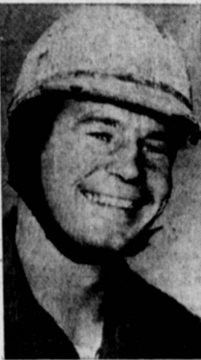
PARNELLI JONES Meets Best Here Today

Parnelli Jones, heavy-footed 25-year old Torrance race driver, leads a pack of Southern Californians against the best from the East and Midwest in the 100-lap USAC national championship late model stock car race today at Ascot Stadium, Gardena. Jones, who'll wheel a 1960 Ford, is rated the outstanding newcomer to big time racing in the country. Veteran Indianapolis driver Rodger Ward