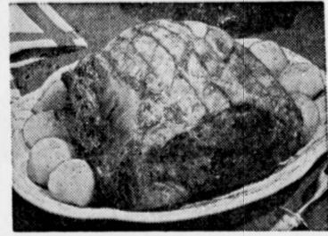
To Roast: Roast to a crisp succulent golden brown . . . to delicious well-done goodness! Serve with applesauce and a relish plate. Get set for a real good eatin'!!