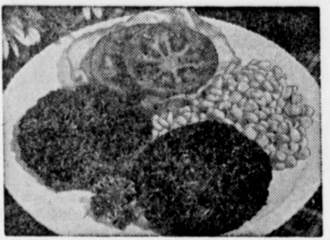
To Broil or Fry: Our famous fresh ground beef makes juicy, tender patties . . . broiled or fried. We suggest buttered corn and sliced