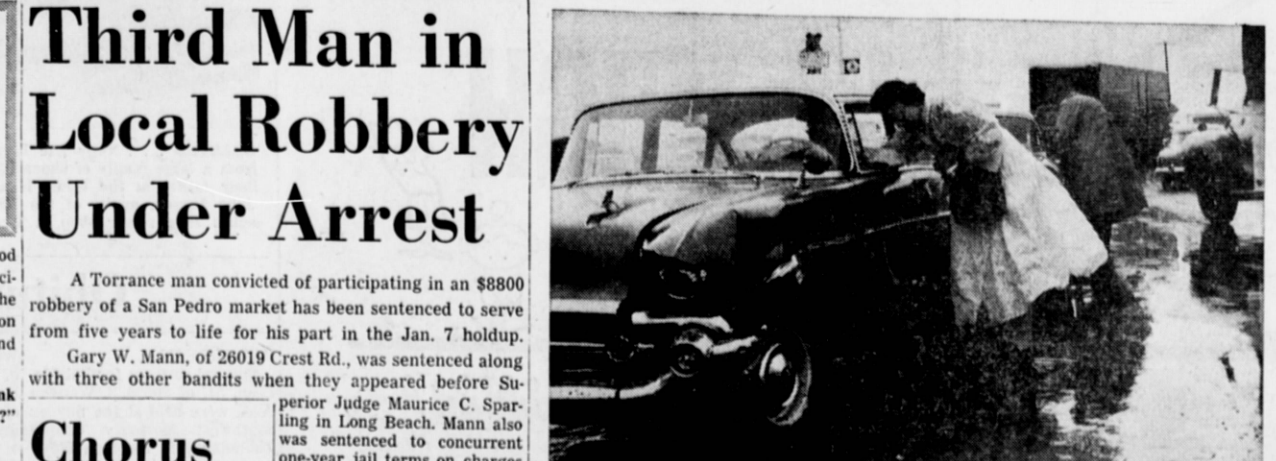
BY THE NUMBERS . . . Rain-slick streets were credited with the responsibility for this four-car pileup Thursday afternoon at Carson and Figueroa. Drivers of the four automo-biles involved survey damage and exchange identifications. None was hospitalized according to reports.