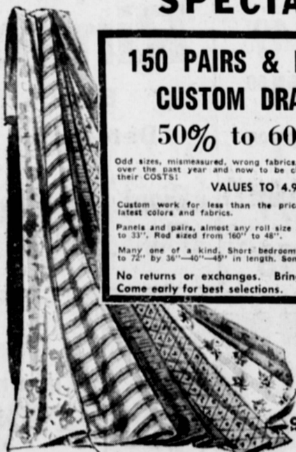
KIRSCH RODS AVAILABLE ALL SIZES

No returns or exchanges. Bring your measurements. Come early for best selections.