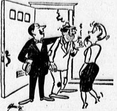
"Dear, you remember your old high school flame—"