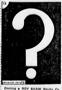
Owning a ROY SHAW Realty Co. HOME will take the question out of your family's future.

Somewhere in the Harbor Area are the unknown living mothers, fathers and children