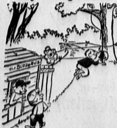
"He's building his own early warning network against invasion by parents."