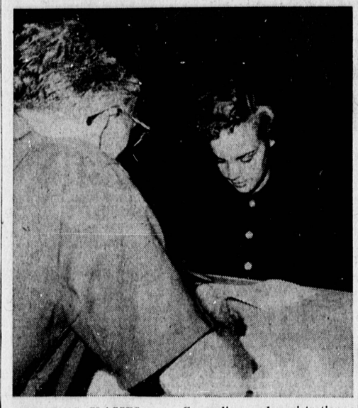
CHOOSING CLASSES . . . Counseling and registration procedures continue at El Camino College in preparation for the opening of classes on Sept. 12. Early signups are encouraged to assure students of securing preferred classes. Placement examinations must be completed five days prior to registration, college administrators advise. Further information may be obtained from the class schedules available in the registration office.