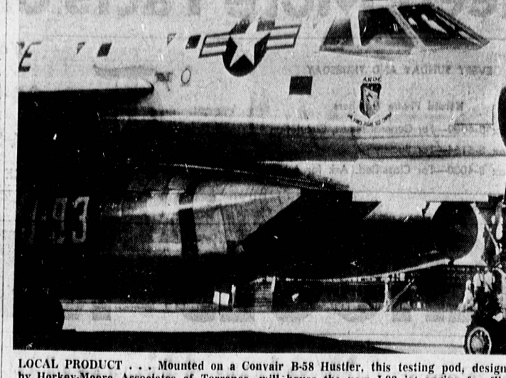
LOCAL PRODUCT... Mounted on a Convair B-58 Hustler, this testing pod, designed by Horkey-Moore Associates of Torrance, will house the new J-93 jet engine for flight testing at speeds and conditions approximating those that would be encountered by the North American B-70 bomber. The pod houses the engine that was developed by General Electric as a part of the B-70 program.

time. Handling all lease negotiations for the Del Amo properties is Coldwell, Banker & Co., statewide real estate firm which operates 12 offices throughout California and Ariana.