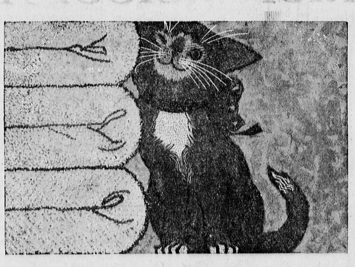
Fastest, most purr-r-fect clothes drying