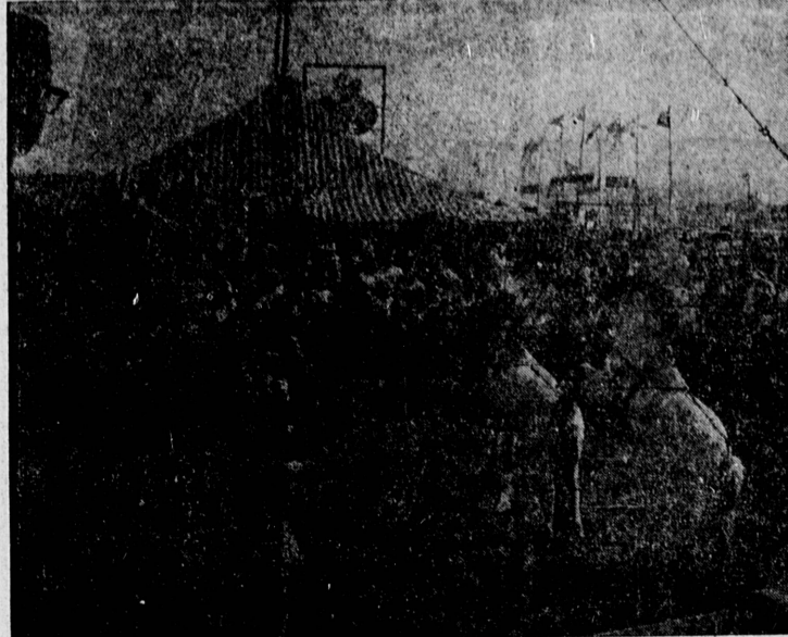
PONY DRILL . . . Among the five acts to be presented three times a day through Sunday at the Foods Co. Market, Pacific Coast Hwy. and Crenshaw Blvd., will be this pony team. Other acts will include clowns, flying trapeze, and Trampoline experisand, of course, Margie, the worlds smallest performing clephant. Free discount tickets for carnival rides can be obtained at the Foods Co. Market.