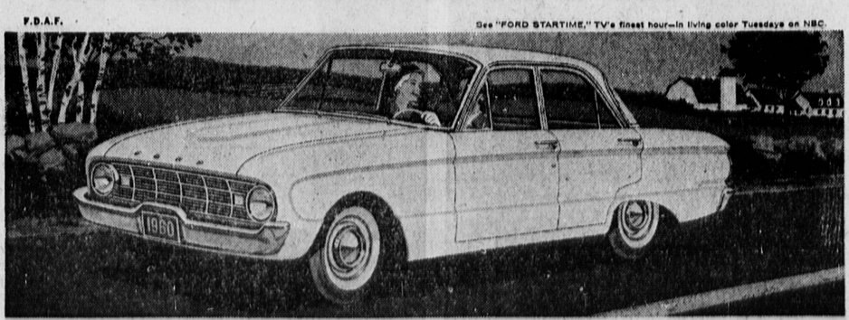
THE BEST-SELLING COMPACT in the Southwest, domestic or foreign. That's the lively Ford Falcon, quality-built, yet priced below any other American-mu

six-passenger car built in America. It saves on gas and oil, maintenance and repairs, even on insurance. Maybe it won't fit into Snoopy's house. But it will fit into your car-buying budget without strain. Try one for size - the new-size Ford Falcon.