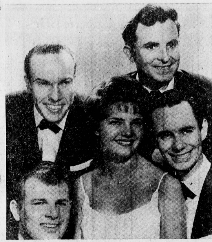
NEW SONG-AND-FUN TEAM . . . Currently entertaining at Marineland Restaurant in Palos Verdes is the sparkling quintet called The Celebrities. An instrumental-vocal group, with an accent on musical comedy, they just opened their initial engagement in the dining establishment's "Porpoise Room."