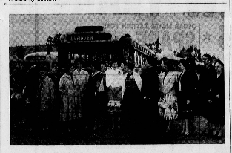
OFF TO SHOW... Part of the crowd of Torrance women which attended the "Queen for a Day" program in Hollywood last Tuesday at which a Torrance salute was telecast on a nationwide network are shown here at the city hall as they prepared to board buses for the trip to the show. Ten busloads of residents were in the caravan.