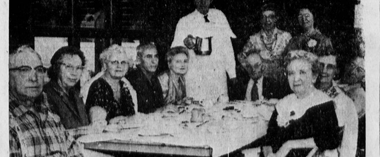
THEY HAD FUN . . . Joining in the holiday enthusiasms, the Senior Citizens club of Torrance staged a festive Christmas dinner and party at the Adult Recreation Center just behind the downtown library last Saturday at noon. It was a pot luck affair served amid gay holiday decor. There was a decorated Christmas tree and a gift exchange.