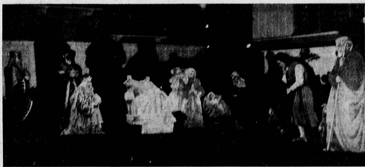
FINE ARRANGEMENT . . . Another cutout nativity scene that attracted much interest in South Torrance was located at the home of W. F. Burke, 22905 Carlow Rd. The interesting lighting and shadow background set the scene off from its hillside position.