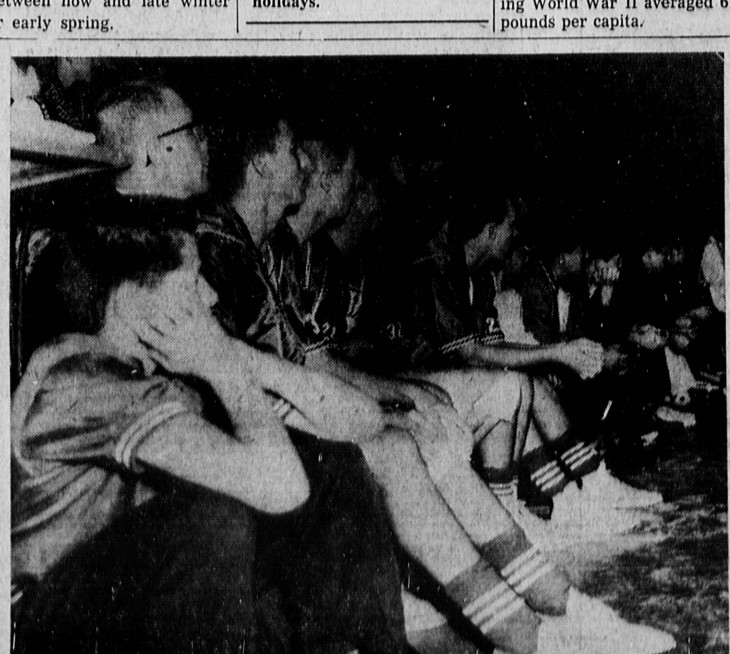
IS IT IN, OR ISN'T IT? . . . South High bench watches action during anxious moments of fourth quarter struggle with St. John Vi anney. Attention is centered on Vianney free throw shooter, who happened to pop in a one-pointer. Vianney scored 51-48 triumph in South's gym.

Scrap rubber collection dur-ing World War II averaged 6.8