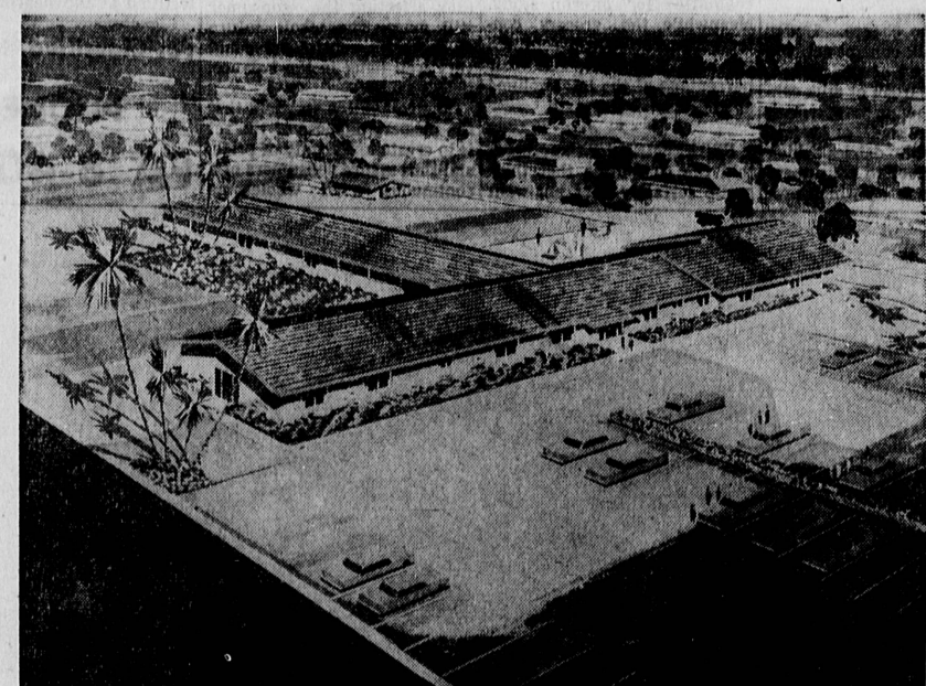
(Architect's Drawing of Golden Age Convalescent Home)

1955 WEST LOMITA BLVD. --- LOMITA, CALIF. Constructed by the Golden Age Convalescent Homes, a California Corporation