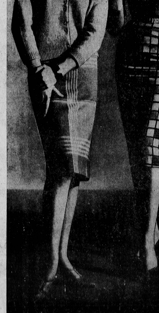
174 AT HAWTHORNE BLVD., PHONE OS. 6-0193, NE. 5-7171, EX. 3-9261 SHOP TUESDAY, WEDNESDAY, SATURDAY 9:30-5:30