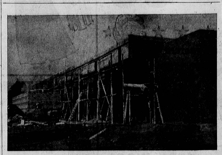
TAKING SHAPE . . . . The new Fox Market, being constructed on Hawthorne Ave. north or Torrance Blvd., is beginning to take shape this week as workmen add exterior brick and facing to the huge store. Opening of the market later this year will mark th third Fox Market to be located within the city. Others are at 182nd and Arlington in North Torrance and at 1321 Post Ave. in downtown Torrance.