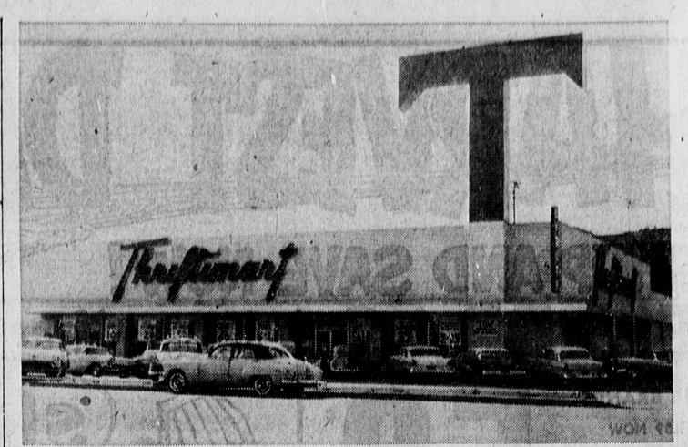
NOTES 29TH YEAR.. Thriftimart Markets are celebrating their 29th year in Southern California beginning today with an anniversary sale. Shown here is the Torrance store at Sepulveda Blvd. and Palos Verdes Blvd., which is joining the storewide celebration.