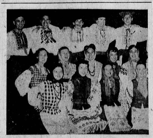
THE GANDY DANCERS . . . One of the foremost exhibition groups in Southern California, shown here in Kujawian costumes, will perform at 8 p.m. Saturday, Nov. 21, at the second annual Books and Arts Fair, to be held this year at the Redondo Beach Eagles Hall, 128 S. Catalina.