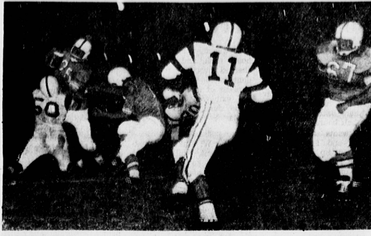
TACKLED HARD . . . Derrick Busch, North High back (25), is stopped by Ron Barron. Morningside High center after a short gain early in the first quarter Friday night in local grid clash. Saxons lost to Monarchs, 13-0.