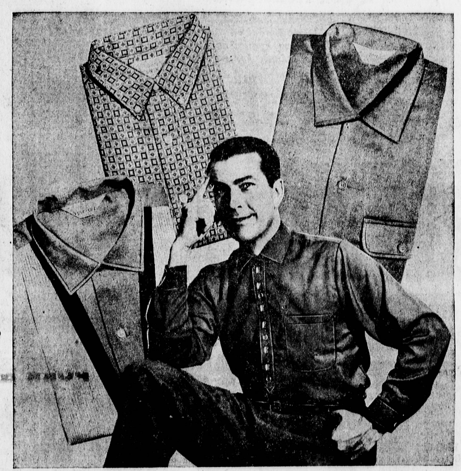
SPECIAL PURCHASE LONG SLEEVE SPORT SHIRTS