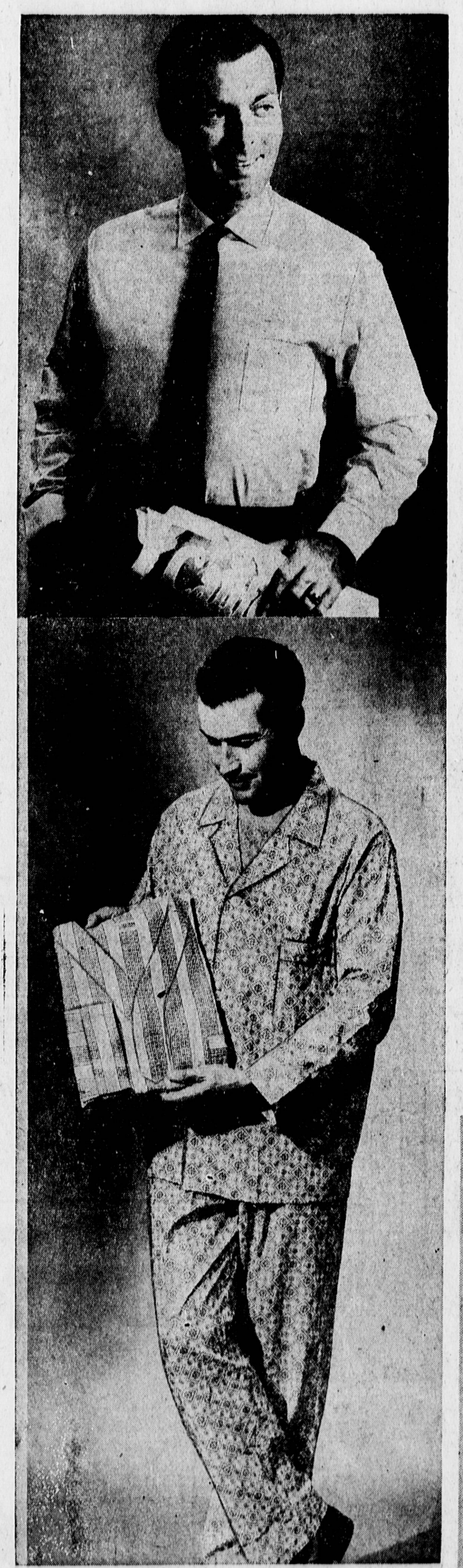
FAMOUS LABEL PAJAMAS