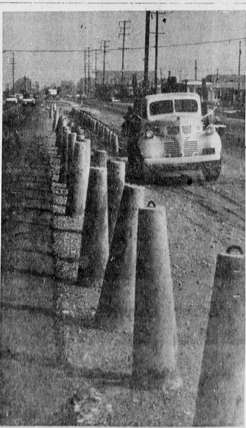
"PIG" ALLEY.. Heavy concrete "pigs," currently being buried in the center strip along Hawthorne Ave, by workmen for a contracting firm engaged by the State Division of Highways, will discourage motorists who have formed the habit of making left turns and U-turns through the unpaved center portion of the busy thoroughfare. When buried, the "pigs" protrude about two feet above the surface.