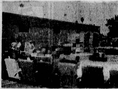
crowds are expected to view the newest styles in hom hings at RAND PARKING LOT SALE — New furniture opliances from 4 warehouses now on display — the great

THURSDAY. FRIDAY. SATURDAY. SUNDAY ONLY. 12 TO 9 P.M., JULY 2, 3, 4, 5