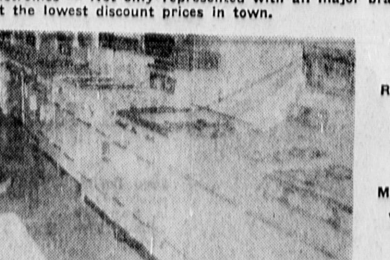
Stoves Refrigerators Washers to Save Many Dollars When You RANDI