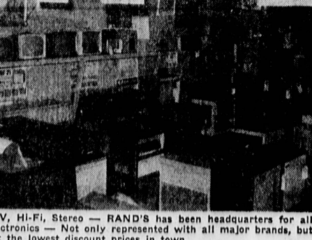
TV, Hi-Fi, Stereo — RAND'S has been headquarters for all eletronics — Not only represented with all major brands, but at the lowest discount prices in town.