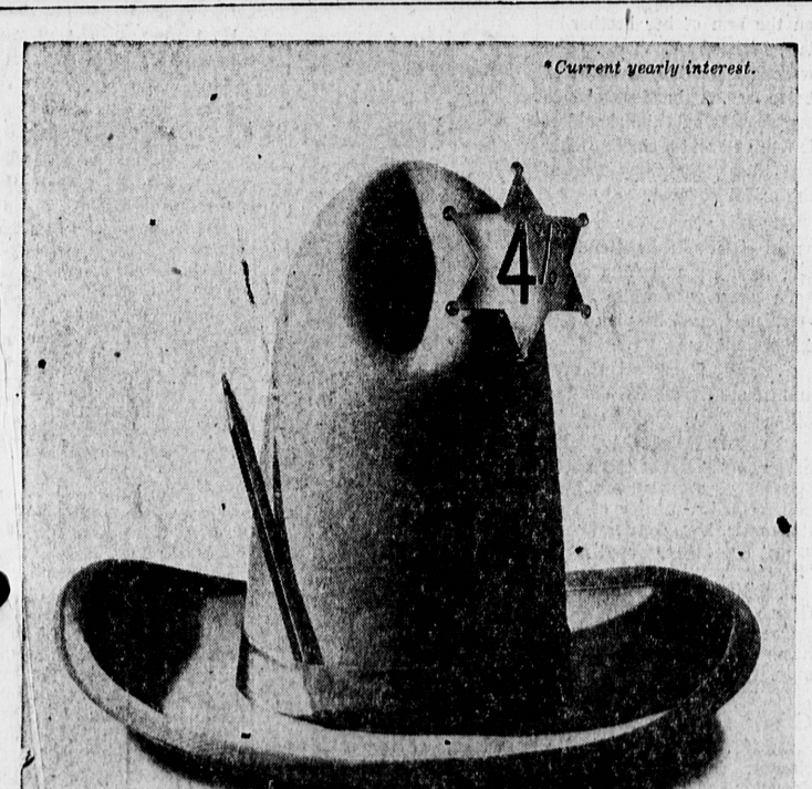
figure it out for yourself

350 American Avenue HEmlock 6-1690 HEMLONG BEACH, CALIF. TALL . TALL . TALL . TALL TALL . TALL . TALL