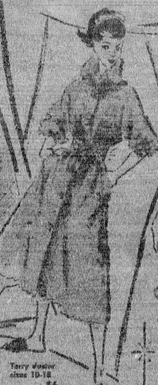
Terry tunic sizes 10-18 $6