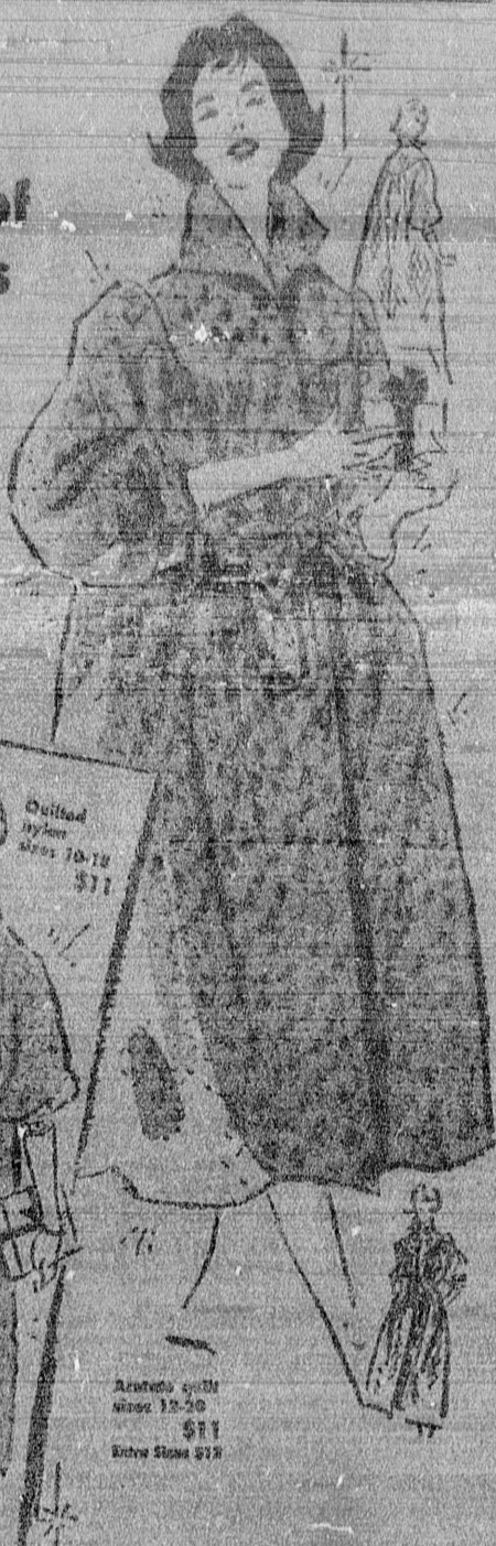
Acetate quilt sizes 12-20 $11 Extra Stone $12