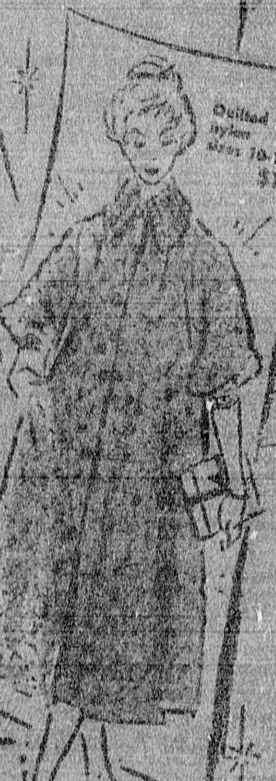
Quilted nylon sizes 10-18 $11