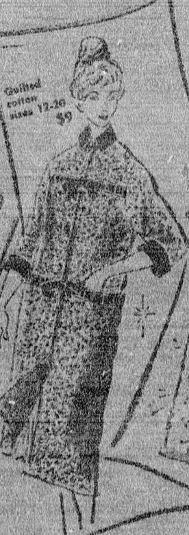
Quilted cotton sizes 12-20 $9