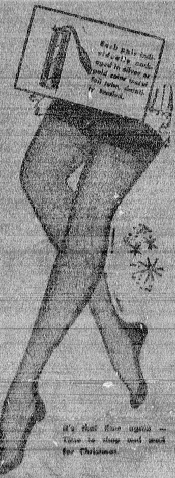
It's that fine again—time to shop and treat for Christmas.

A glamorous gift to hang on her toe, in its own royal foil label. Beautiful nylon, flawlessly sheer and sheer top to toe, full fashioned for extra-hair-softing. Royal Purple and Royal Nylon. Sizes 7 1/2 to 11. Buy a dozen for a gaily decorated tree and a most thoughtful gift.