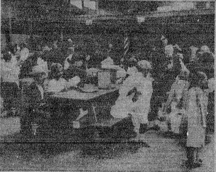
GHOSTS, GOBLINS, WITCHES... One of the biggest events on the school calendar is being enjoyed here by youngsters at the Seaside school. Last Saturday the PTA staged its annual Carnival for parents and youngsters. Games, movies, food and a costume parade were the order of the day.