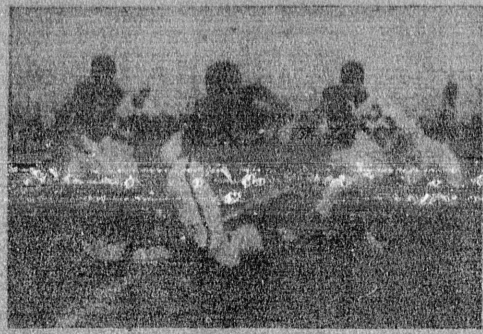
GOAL ROUND . . . Cliff Roy, Spartans right end, pivots away from a Falcon tackler after taking a short pass Friday afternoon. Locals won game, 58-0.