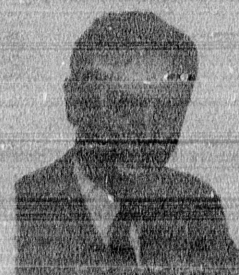
CECIL B. KING Congressman, 17th District