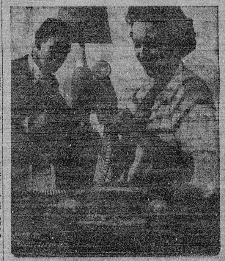
FASHION TEST FOR PHONES—how we check new designs with you today so your phones will give more pleasure tomorrow

"How Meetal Housecleaning Aids in Heating"