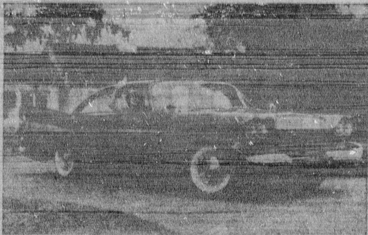
PLYMOUTH INTRODUCED TODAY . . . On display at Herman Miller Plymouth showroom, 1600 Cabrillo Ave., topping the new line of Plymouth luxury cars, the Sport Fury, features two-door hardtop styling, massive front bumper with lattice grille, and outward-canted tail fins. The new compound windshield curves into the roof as well as wrapping around the sides. Swivel front seats are standard equipment on the Sport Fury.