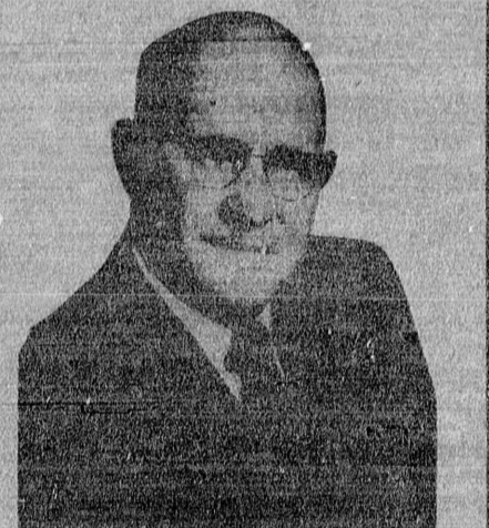
A. O. SAGE Prominent Bible Lecturer

PROGRAM FOR THE WEEK FRI., OCT. 3 - "UNDER LAW OR GRACE" Sound Picture King of Kings - Cecil DeMille SAT., OCT. 4 - "BLOOD AND SNOW ON HILLS OF LOS ANGELES" Sound Picture - Family Afoot in the Yukon SUN., OCT. 5 - "MARK OF THE BEAST -- WHO HAS IT?" Sound Picture Beaver Valley - Walt Disney WED., OCT. 8 - "HYPNOTISM AND BRIDEY MURPHY"