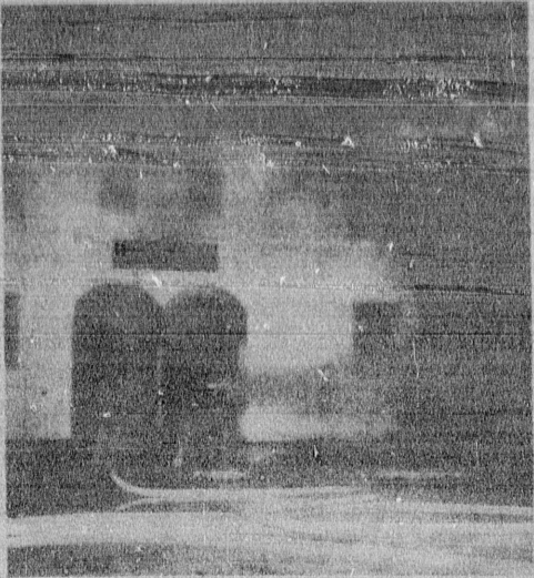
BATTLE BLAZE . . . Firemen struggle to hold high pressure hose during height of firefighting operations early Thursday at the Riviera Club. The swim pool was one of the dry spots of the building when it was all over. It had been drained.