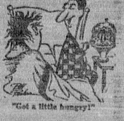
"Got a little hungry!"