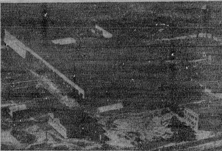
BEFORE . . . The Ryan plant on Torrance Municipal Airport looked like this a little more than one year ago when the company occupied the facilities formerly the home of the National Electric Products Co.