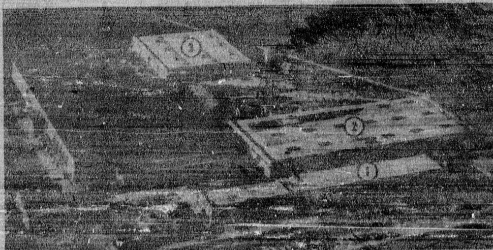
AFTER . . . This was the plant that went on public display for the first time during Airport Days yesterday. New structures completed by the Ryan firm include