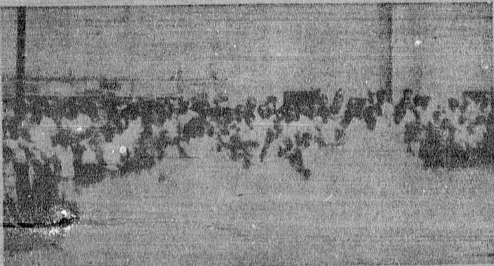
SAFETY TECHNIQUES . . . Technicians demonstrate fog and foam firefighting equipment during yesterday's Airport Day celebration at the Torrance Municipal Airport. The demonstration was part of the exhibit of equipment and facilities allied to the operation of planes and an airport.