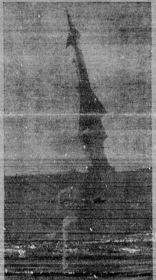
INSPECT NIKE . . . Crowds at the Airport Day festivities yesterday were impressed with the operational possibilities of the Nike, one of the nation's front line defense weapons. The National Guard will take over the local battery at the airport next Sunday.