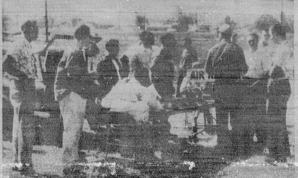
RACE HEADQUARTERS . . . Pilots and passengers crowd around the official check-in station yesterday before taking off on the cross country trophy dash to Palm