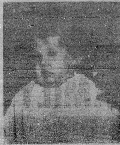
When a mother tells you, 'What is she doing in a barber shop?' Probably she's her curls trimmed or styled.