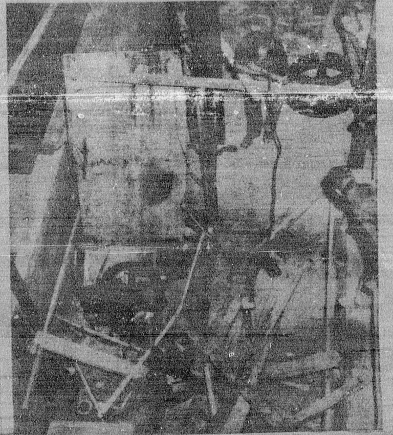
INSPECTING FALL SCENE.. Workers and police investigators inspect the bottom of the elevator shaft where one man was killed and three others injured Friday when a temporary elevator tumbled 100 feet during construction at the Del Amo Shopping Center.