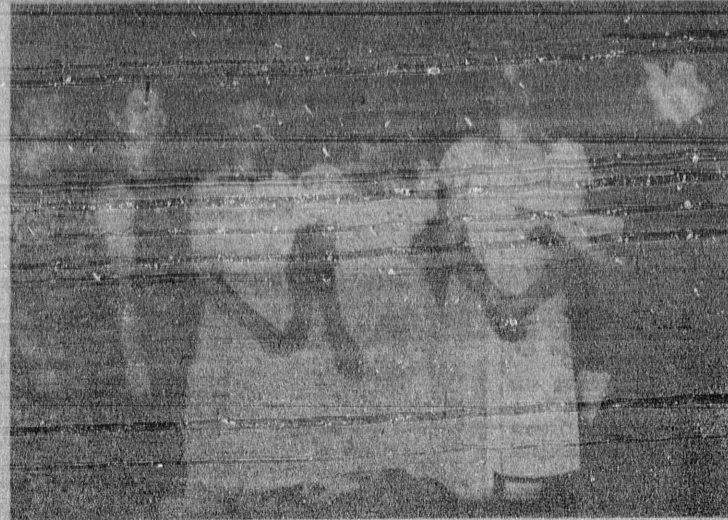
NEW OFFICERS... Installed at a recent banquet of the Eta Kappa Chapter were new officers...