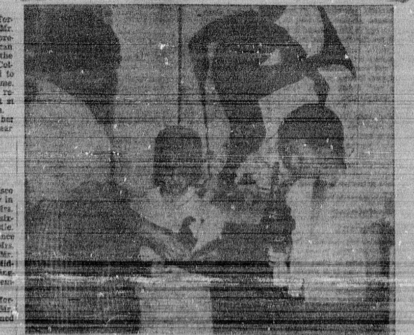
A PUPPET FANTASY... At the Arts and Crafts center, under the direction of the Recreation Dept., children are making puppets for a show to be presented in the near future.