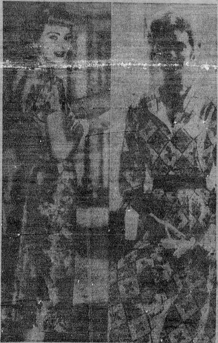
THE PARTY DRESS ... For late-day or evening wear, this completely feminine dress demands the lustrous look of poppy printed coutou satin. The low, square-cut neckline draws attention to pretty shoulders and back, while the fanlike drape is as new as tomorrow.

Buy thread, seam tape, zippers, buttons, and any necessary trim at the same time you purchase your fabric. This will save time and trouble later, since stores usually carry sewing notions such as thread and seam tape coordinated in color to the piece goods they have in stock.