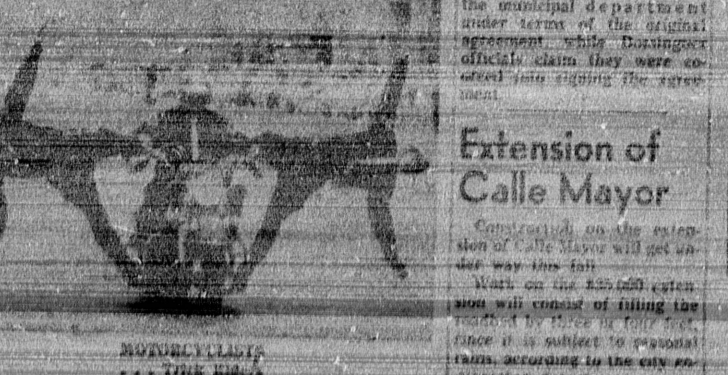
MOTORCYCLIST ... Trick Rider