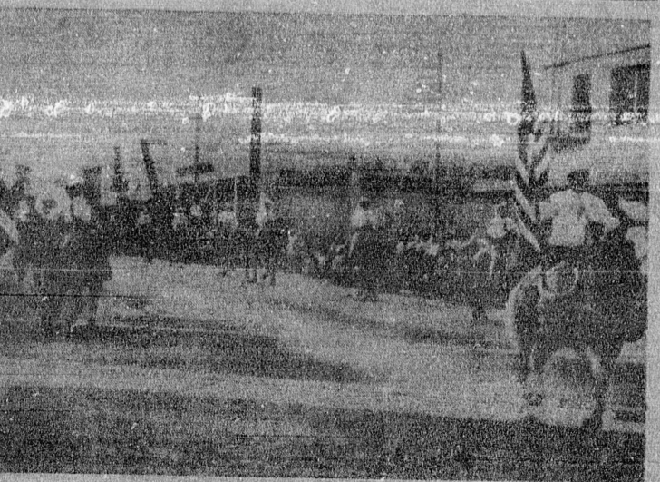
TORRANCE MOUNTED POLICE ... Always a Parade Attraction