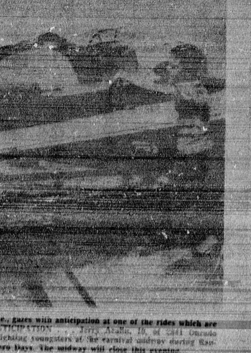
Ave. gazes with anticipation at one of the rides which are anticipated. Jerry Atalla, 16, of 4441 Orange deliriously youngsters at the carnival midway during Ranchero Days. The midway will close this evening.

Work on the $25,000 extension will consist of filling the roadway by three to four feet, since it is subject to seasonal rains, according to the city engineering department.