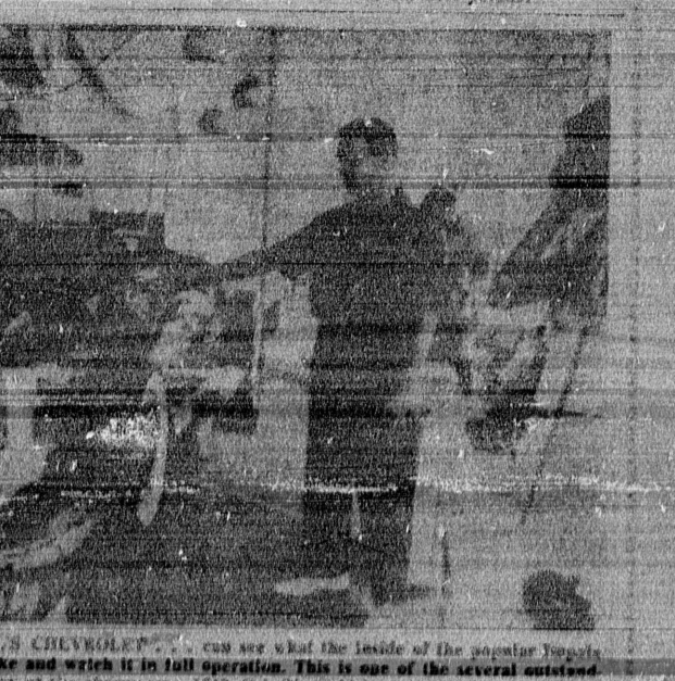
VISITORS TO PAUL'S CHEVROLET . . . can see what the inside of the popular Young's sports coupe looks like and watch it in full operation. This is one of the several outstanding exhibits on display at the showroom, 1640 Cabrillo, which are part of the famous Chevrolet Featurama, traveling automotive engineering show.

Complete lineup of parade units and other entries will be found on Page 2.