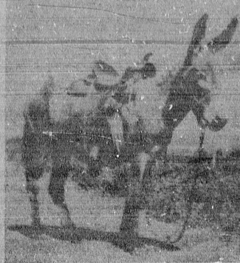
PEPPIU... Stock, gentle Mexican burro, Peppe, will be in front of the new Harbor Savings and Loan Assn. building, 1812 S. Pacific Coast Hwy., Rosendo Beach, July 1 through 16. He is to be given away free with saddle, to the lucky child under 15, who has taken a free chance on the July 16 drawing. An adult must sign up at Harbor for each child.