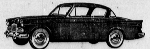
D-117 Hillman Minx Husky

That's right. During this week end only, we'll buy the first 10,000 miles worth of gasoline for every car we sell! And what magnificent cars! The exciting HILLMAN — with 4-speed transmission, room for the whole family, highway speeds of over 80 mph, 30-35 mpg, famous precision-built engine, unitary construction! And the all-new SUNBEAM RAPIER — with sportscar zoom, family car room! Never before has there been such an amazing offer! And it ends, positively, this Sunday night! This is your once-in-a-lifetime opportunity to make the smartest buy of your life! Come in today, and choose the exact model and colour you want! Hurry!