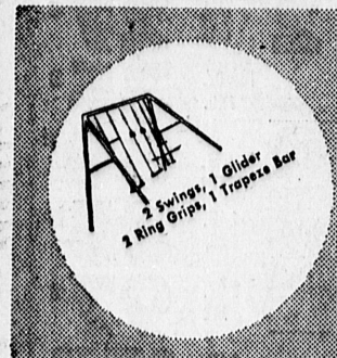
CHILDREN'S SWING SET With Castiron Corners