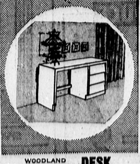
DESK In ready-to-finish hemlock. Center Hand sanded. 19" 29.95 Value

ready-to-finish hemiock—16"x43'4" Reg. 39.95 . . . 33.99 Reg. 49.95 . . . 41.88