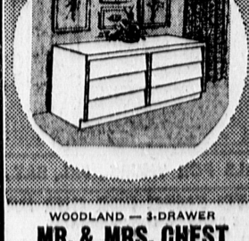
MR. & MRS. CHEST

ready-to-finish hemiock—16"x43'4" Reg. 39.95 . . . 33.99 Reg. 49.95 . . . 41.88