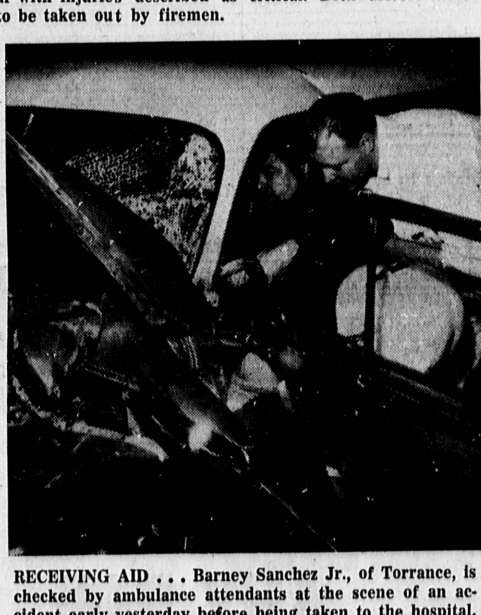
checked by ambulance attendants at the scene of an ac-cident early yesterday before being taken to the hospital. He received major injuries.