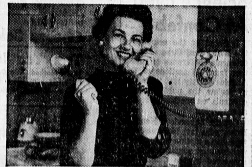
MOTHER'S DAY — SUNDAY, MAY 11th

Why are these two phone men having such a hard time opening that metal box? You can blame it on corrosion. It can rust or crack even tough metals, and here it has sealed the box shut. Phone wires from your house are connected to a box like this. But this one, in a special test, was exposed to wind, fog and ocean spray. We use these tests to learn new facts about corrosion. We also test to find metals that can resist it, yet are economical. By controlling this and other destroyers, we save thousands of dollars worth of equipment each year—and make your service still more reliable.