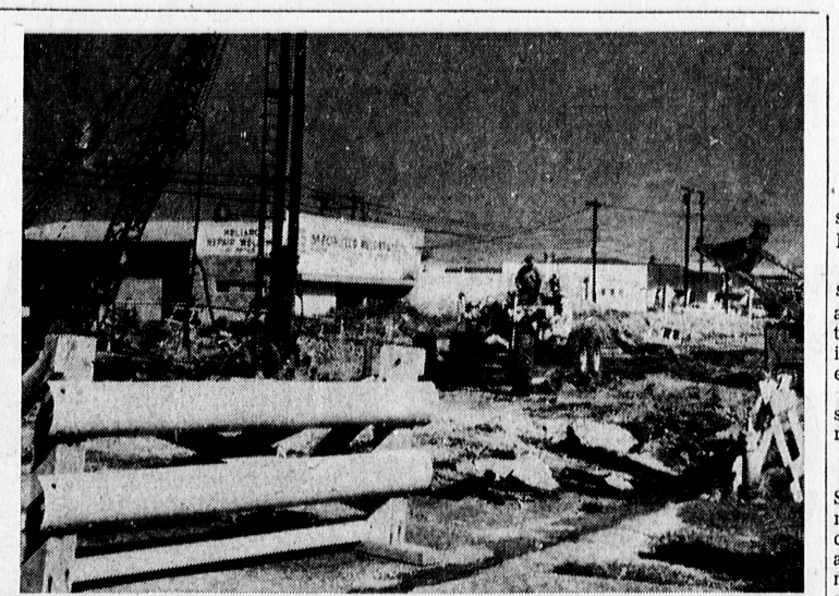
STREET REPAIRS . . . Workmen busily worked on repairs on 174th St. between Gram-ercy Pl. and Western, repairing damage done by the downpour which descended on Wednesday. Two lanes of the street, which was previously under construction for a bridge over the Dominguez Channel, were washed out. Traffic was detoured at Gramercy Pl. over the Dominguez Channel, were washed out. Traine was detouted at Granup problems. and Western Ave. Many other parts of Torrrance faced similar cleanup problems.