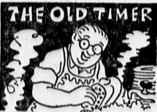
"Men who win their wives by soft soap often end up washing the dishes."