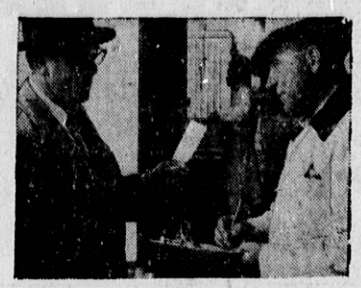
Our network of buyers find and rush to us special purchases of merchandise that we offer you at extra savings.