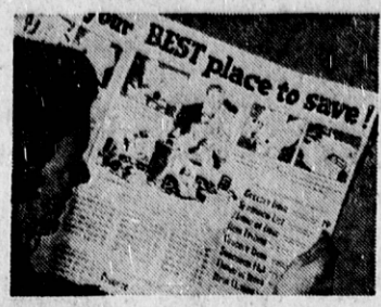
Weekly specials, too! In addition to low prices on all items, we offer you extra savings each week in the form of specials. Look at the examples in this ad.