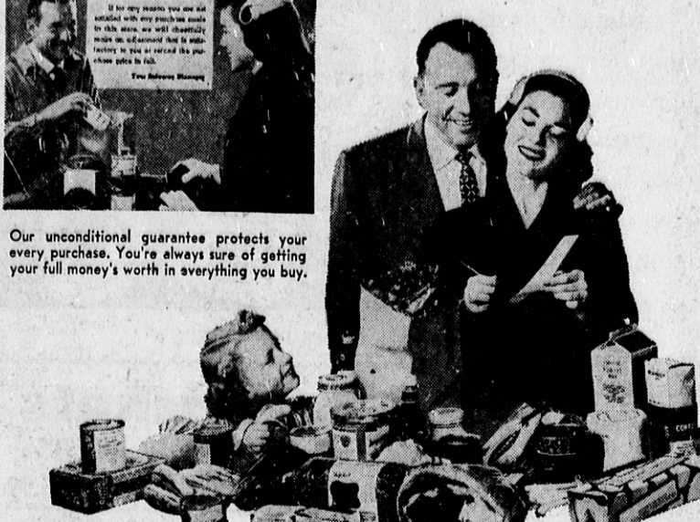
Are you enjoying the savings and other shopping advantages offered by our new program of better service and lower prices? Since the start of the program over two months ago, thousands of shoppers have found it to be the answer to a lower total food bill for them. Time after time, we've had folks who are shopping here for the first time remark with surprise at the low total cost when their purchases are added up. We believe one shopping trip will convince you that you, too, can lower your total food bill here.