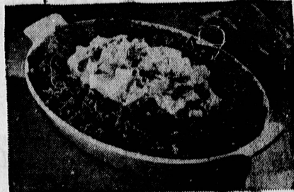
SAVORY SAUSAGE WITH NOODLES One pound of sausage and a package of noodles start you on the right trail to this superb meal for six. A satisfying, thrifty dish for hearty eaters.

Rice Showboat Long Green Label 1-lb. pkg. 18c 2-lb. pkg. 35c Rice Showboat Zenith Red Label 1-lb. pkg. 17c 2-lb. pkg. 33c White Rice MJB Quick 16-oz. pkg. 21c Brown Rice MJB Quick 24-oz. pkg. 31c