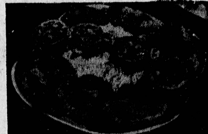
PORK CHOP SKILLET MEAL Picture it on your table! Nicely browned chops, rice simmered in bouillon, tomato halves on onion slices, with green pepper rings. (See your FREE recipe leaflet.)